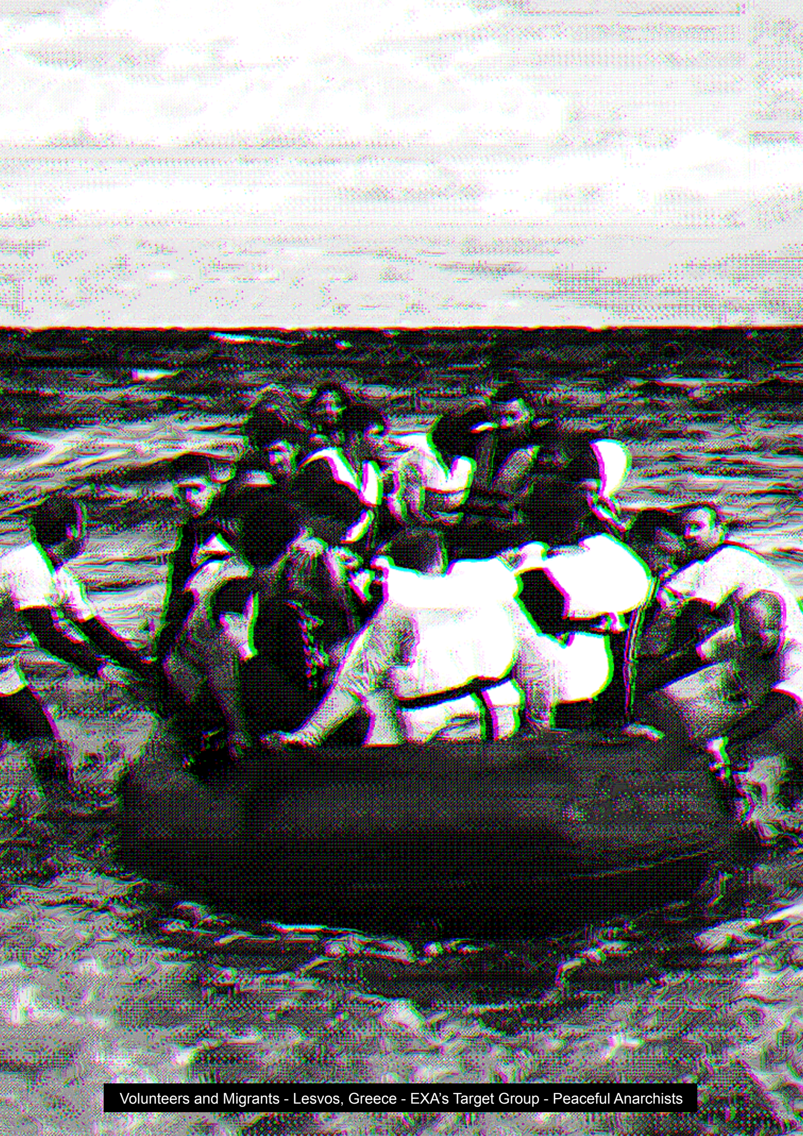
Volunteers and Migrants - Lesvos, Greece - EXA's Target Group - Peaceful Anarchists