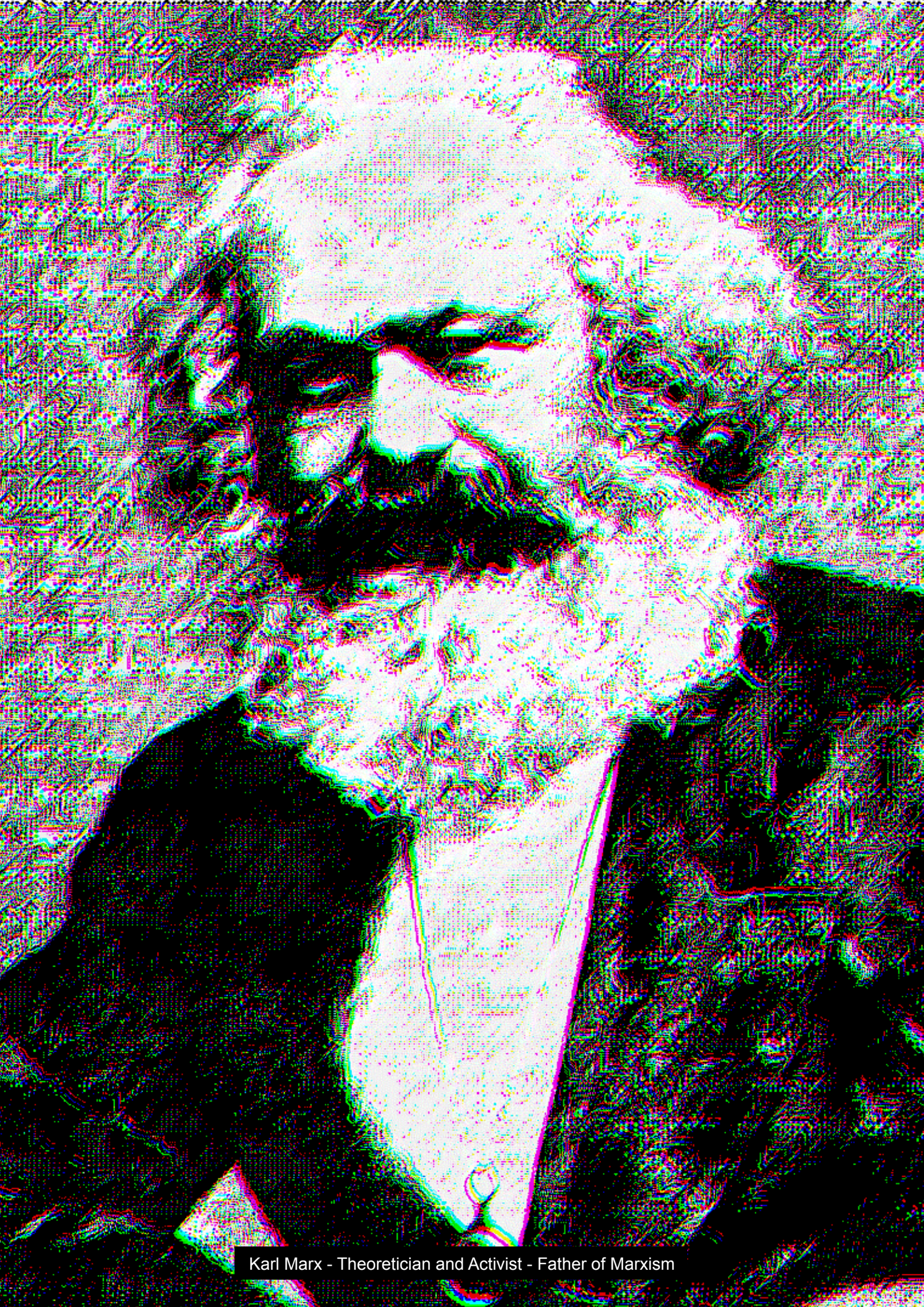
Karl Marx - Theoretician and Activist - Father of Marxism