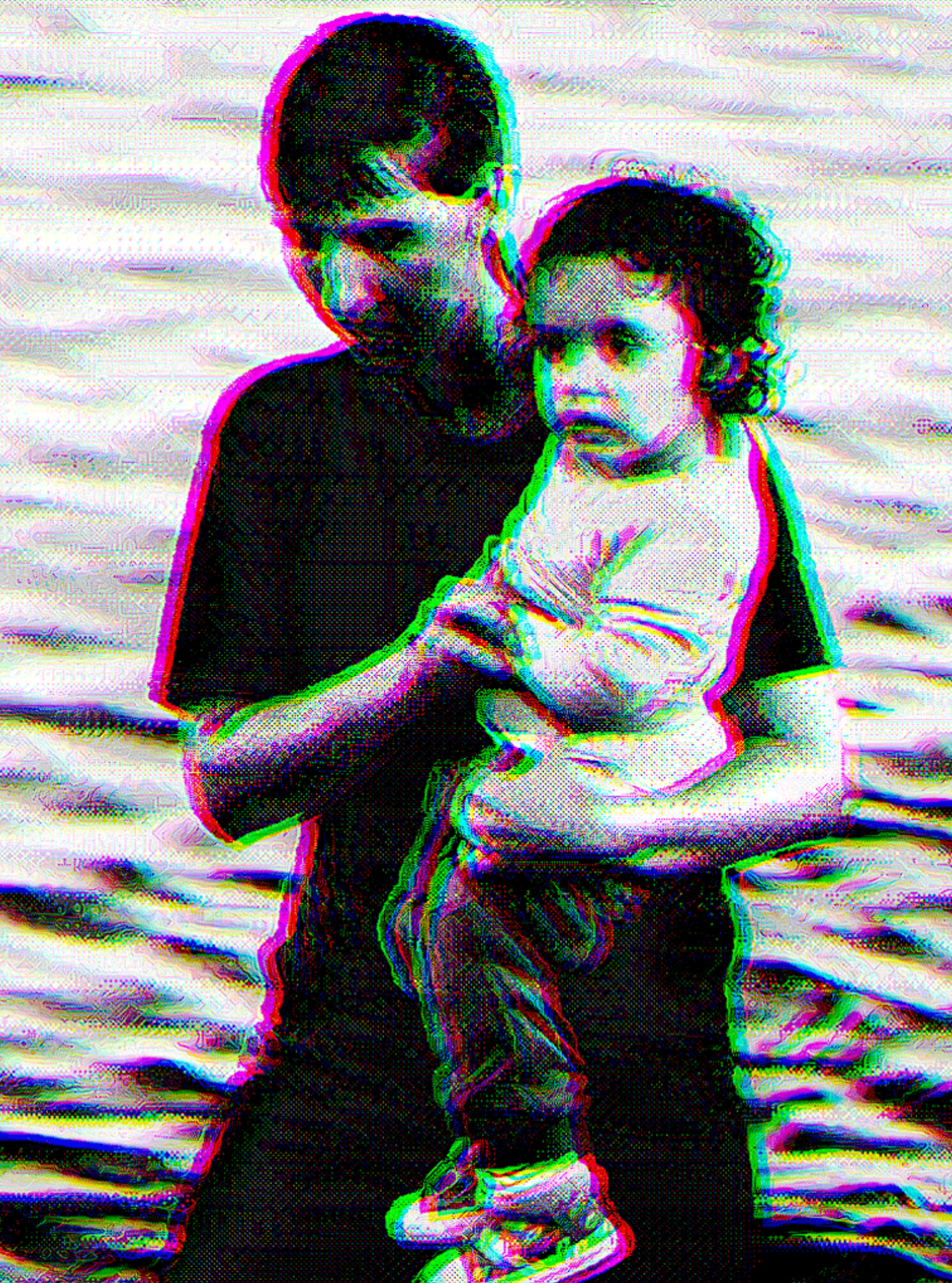
Volunteer and Migrant Child - Lesbos, Greece - Overwhelming goodwill - EU labels them as 'smugglers'