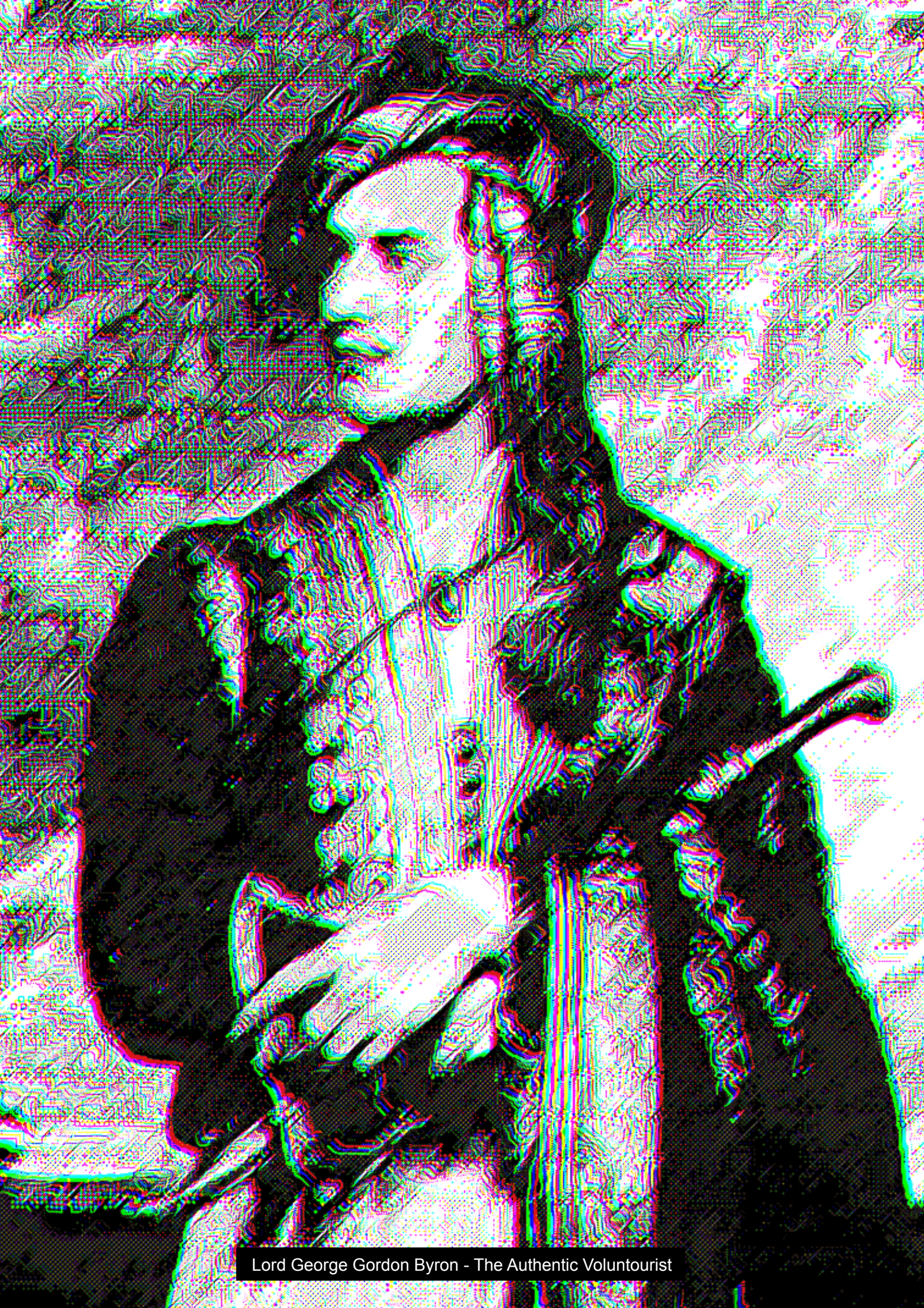
Lord George Gordon Byron - The Authentic Voluntourist