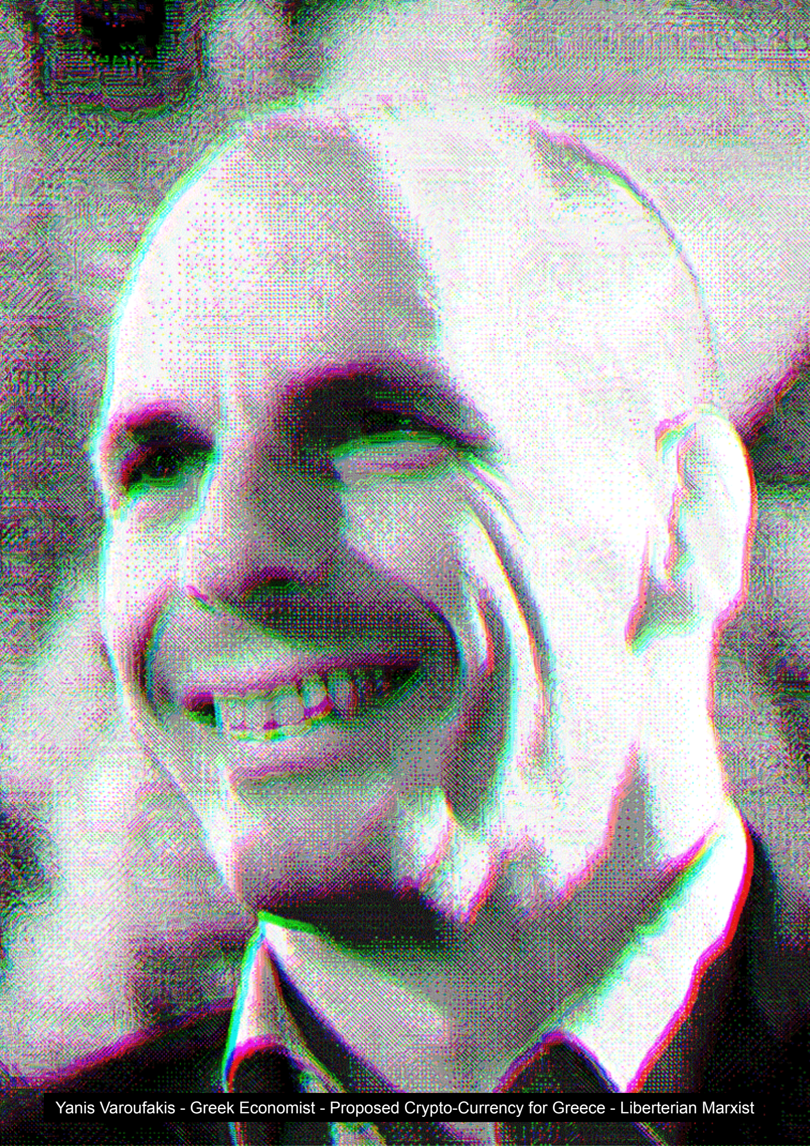
Yanis Varoufakis - Greek Economist - Proposed Crypto-Currency for Greece - Liberterian Marxist